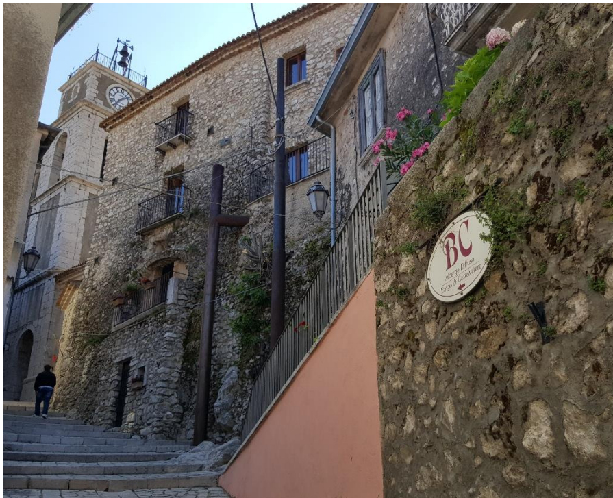
The widespread hotel of Castelvete sul Calore (Avellino)