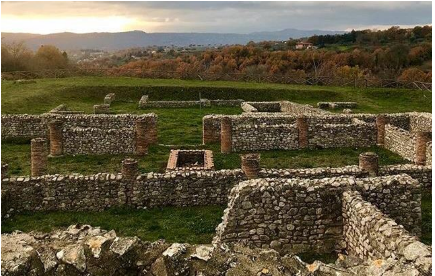
Aeclanum Archaeological Park, roman domus (1st century AC)