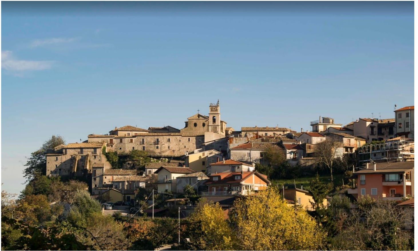
Castelvete sul Calore (Avellino)