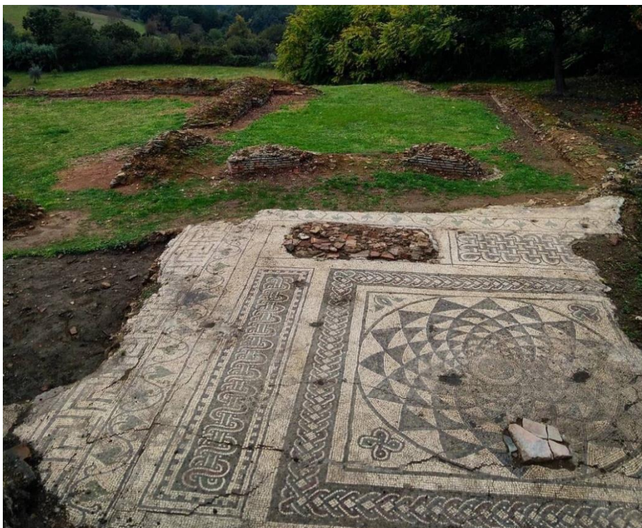
Aeclanum Archaeological Park, mosaic flooring